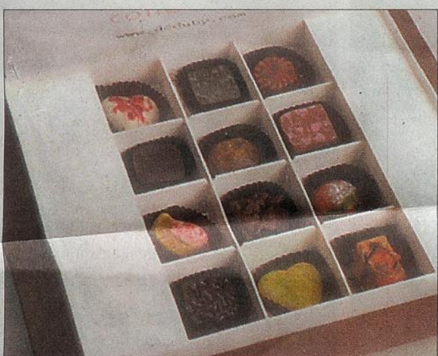
Chocolates from the Inaugural Collection by D.C. Duby.